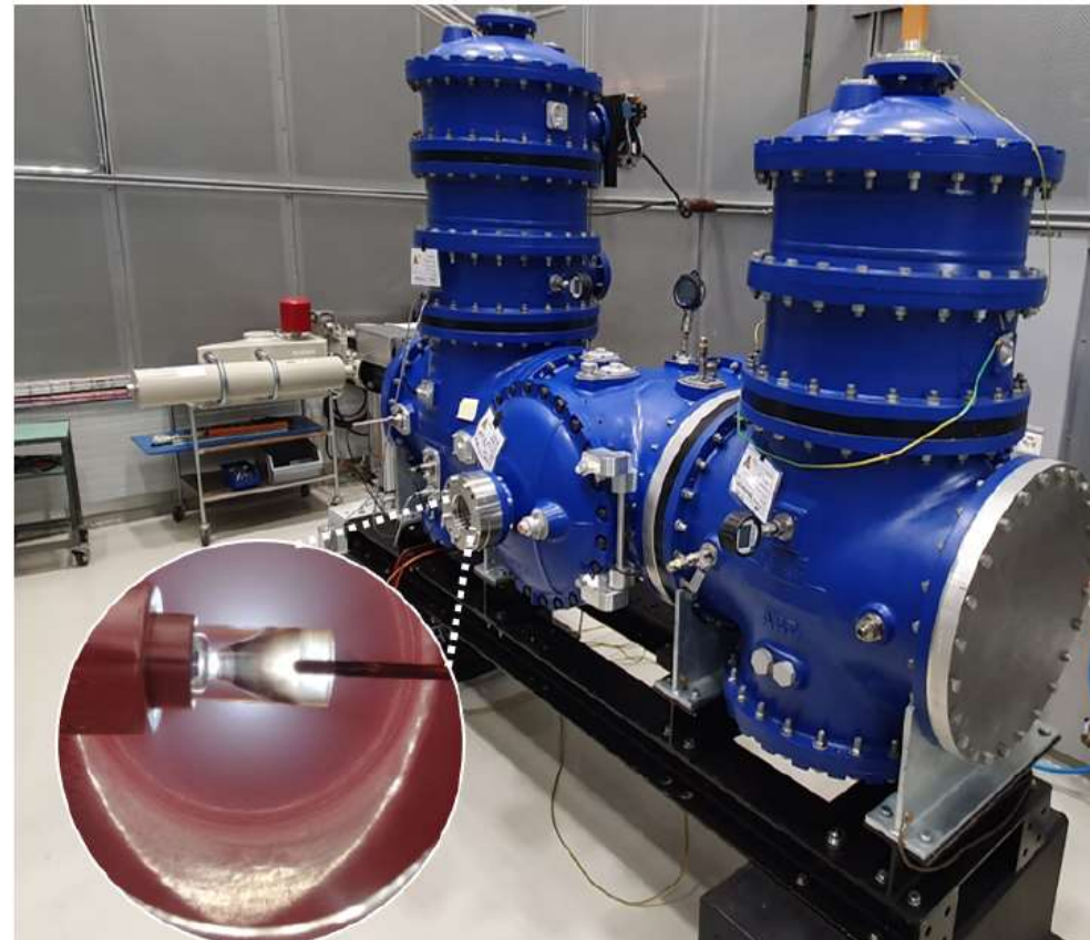
[High-Voltage Laboratory ETHZ]