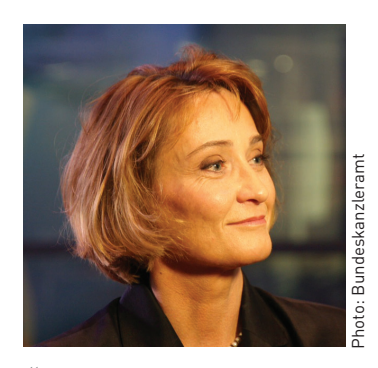
"The CAS PGA at ETH Zurich combines insights from Switzerland's rich history of good governance with global best practices. The program is highly relevant to public sector professionals all over the world."