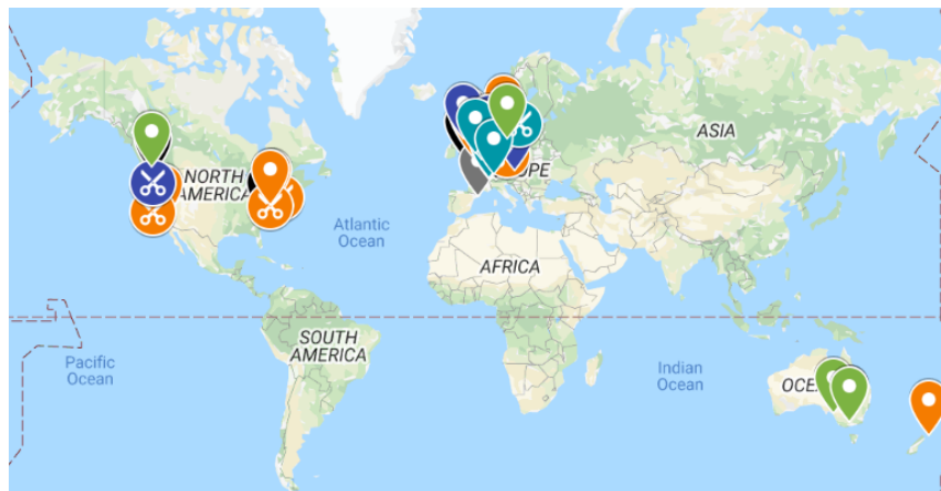
Own illustration using Google Maps: Academic institutions with past or ongoing efforts to reduce greenhouse gas emissions from members' air travel