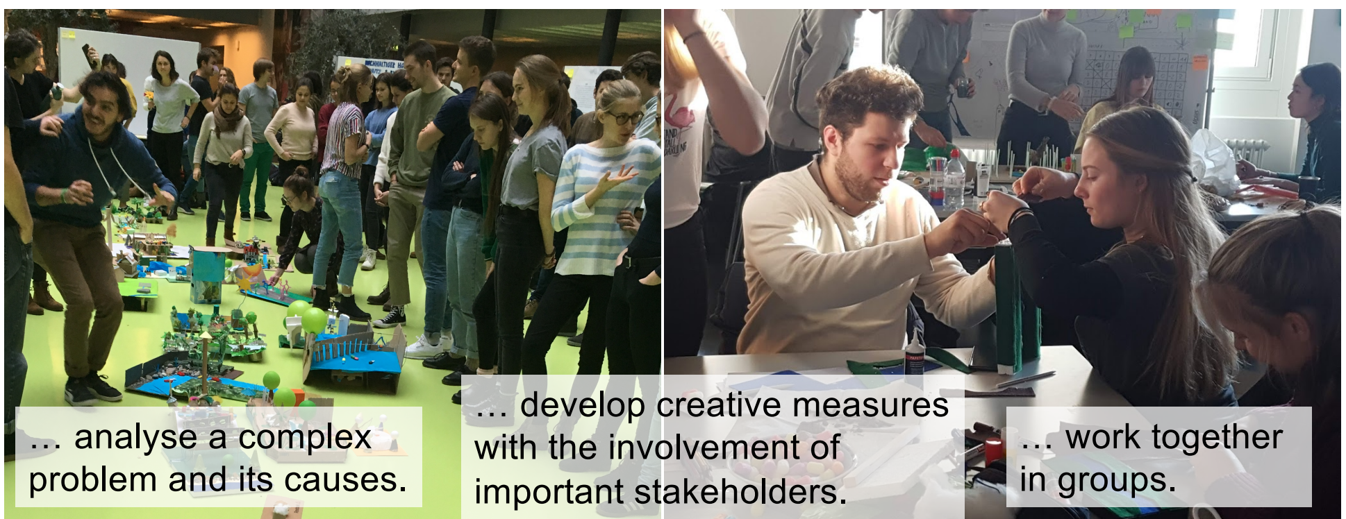
... analyse a complex problem and its causes.