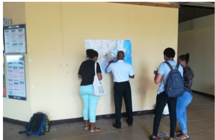
Pin pointing their next location

Each group had a specific theme to study focusing either on the freight system or cable car oppor-