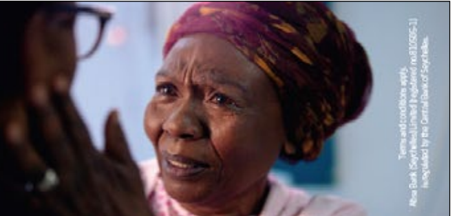
Seychelles Journalist Register no. 03055-21. Regulated by the Central Bank of Seychelles.