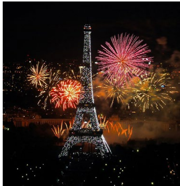
France celebrates independence day