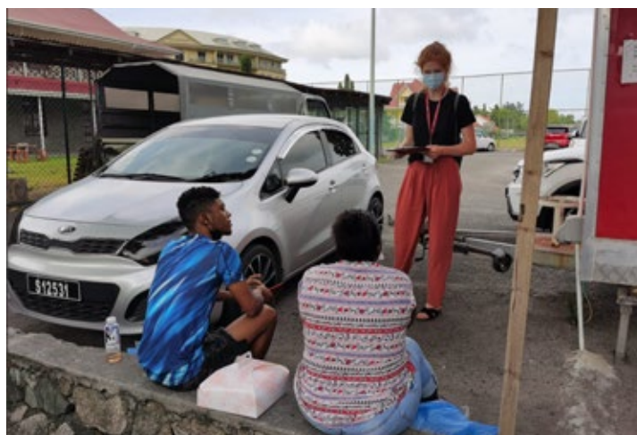
Students hard at work

The study will continue until the 24th of July and the ETH Zurich students will return to home. The team hopes to present the finalised and validated Report to the relevant authorities such as MoT, SPA and SPTC by the end of 2021.